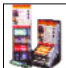
Acrylic Display Racks