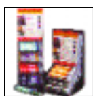
Acrylic Display Racks

www.amc-products.com info@amc-products.com