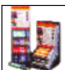
Acrylic Display Racks

www.amc-products.com info@amc-products.com