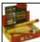
Pop-Up Cardboard Display Carton

QuikCopper® epoxy is available in 3 1/2" (2 oz.) and 7" (4 oz.) lengths. Individually packaged in reusable clear plastic tube with tri-lingual (English, Spanish, French) instructions and plastic friction top. Packed 12 sticks in display carton – 2 display cartons per master carton, or 24 sticks per shipper carton. 3 1/2" sticks are also available in blister packs (12 per carton).