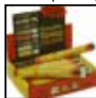
Pop-Up Cardboard Display Carton

FastSteel® epoxy is available in 3 1/2"(2 oz.) and 7" (4 oz.) lengths. Individually packaged in reusable clear plastic tube with tri-lingual (English, Spanish, French) instructions and plastic friction top. Packed 12 sticks in display carton – 2 display cartons per master carton, or 24 sticks per shipper carton. 3 1/2" sticks are also available in blister packs (12 per carton).